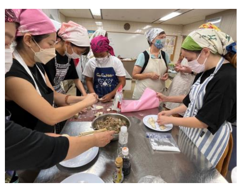
International Cuisine Cooking Class