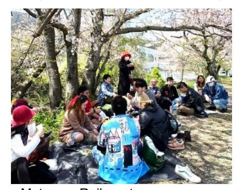
Matsuura Railway to Cherry Blossom Viewing

With the revision of the technical intern training program and specified skilled worker, it is expected that it will become easier to accept people from foreign countries. We will work hard to create a symbiotic society so that foreigners can eliminate their "language anxiety" and live without worries.