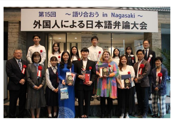
After the speech contest, with the contestants

Thank you to all the contestants who put in a lot of effort and presented us with wonderful and memorable speeches.