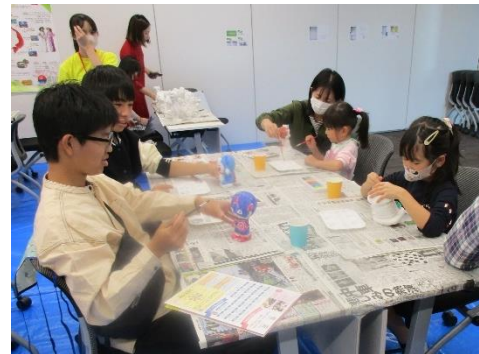
Kimono and Tea Ceremony Experience Vietnamese "Statue" Painting Experience