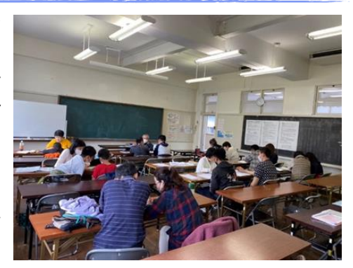
Japanese language class

Friendship International Sasebo (FIS) was established in 1998 by enthusiastic volunteers in response to the demands of the times. Since then, we have been conducting volunteer Japanese language support activities for foreigners living in the suburbs of Sasebo City. Currently, we are running four Japanese classes a week at two locations within Sasebo City, which are attended by 30 foreigners from 11 different countries. Participants include technical intern trainees, international students, ALTs, foreigners who moved to Sasebo due to an international marriage, elementary/junior high/senior high school students attending a Japanese school, as well as foreigners living in faraway locations such as Saikai City, Matsuura City and Hasamicho, who willingly travel a long way to attend the lessons. Although it has been 15 years since I retired and began my activities with this organization, I have been serving as the organization's representative since the year before last.