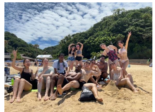
Photo from Iojima on Marine Day

Currently we are continuing activities such as English conversation class and contract bridge (a type of card game), and hold cultural events such as World Foods and concerts once a month. Coming from zero prior international exchange experience myself, at first I expanded my opportunities for exchange by sharing the joys of each season with my foreigner friends. My English level is poor, and I am still learning, but recently we all went to Iojima together on Marine Day. To expand upon this, it would bring me great joy if Chikyukan can become a place where anyone can experience international cultural exchange without having to study abroad (and a place that directly connects Nagasaki with the rest of the world), and a fun place for foreigners to enjoy Nagasaki life.