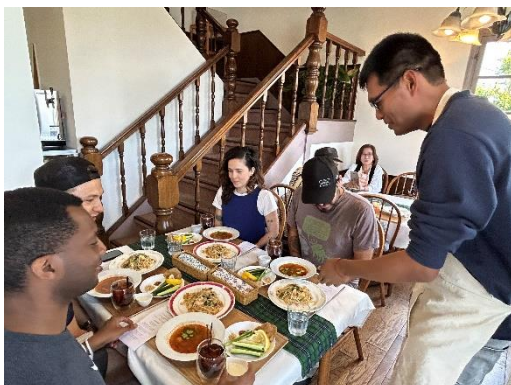
World Foods Restaurant at the 26 th Anniversary Event