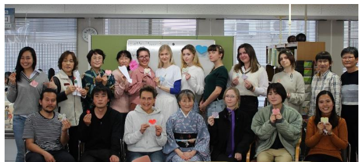
Commemorative photo taken with the completed products!