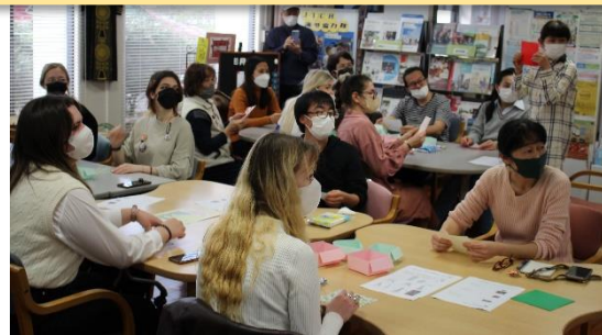
Everyone listening carefully to the teacher’s instructions