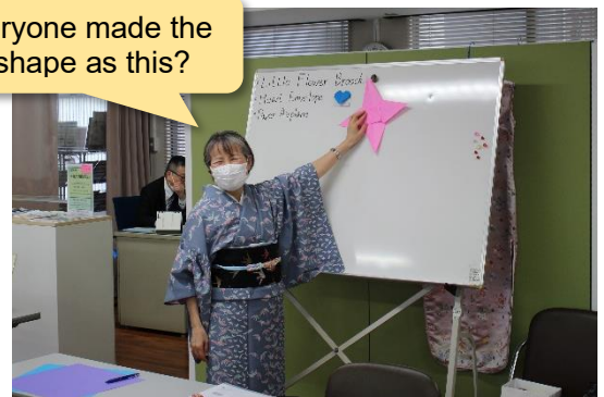
Has everyone made the same shape as this?