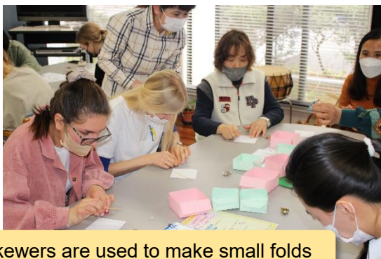
Bamboo skewers are used to make small folds