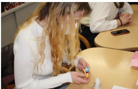
Finally, varnish is applied to complete!