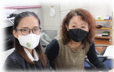
The two volunteers on Thursday