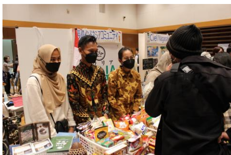
Sale of products from Indonesia such as Halal food