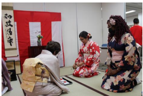
Experiencing a Japanese tea ceremony while wearing a kimono