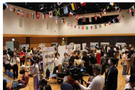
Appearance of the venue