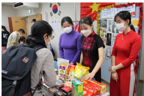
Trying on Ao Dai and sale of Vietnamese coffee