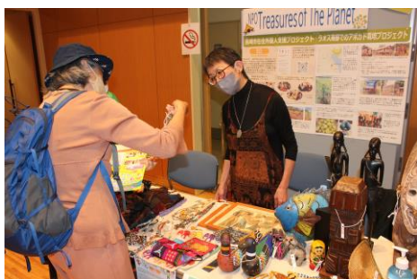
Sale of accessories and other goods from developing countries

On November 3 rd (Thursday, public holiday), the first face-to-face Nagasaki International Festival in three years was held at the Merca Tsuki-machi (Tsuki-machi, Nagasaki City)! About 1000 people attended the festival and the venue was filled with excitement as international exchange groups from Nagasaki Prefecture exhibited their culture and group activities, sold traditional goods, hosted activity/experience booths, performed on the stage, and more. Thank you to everyone who participated in the event!