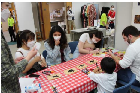
Trying dot painting at the JET Booth