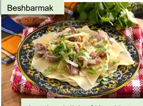
A national dish of Kazakhstan using mutton