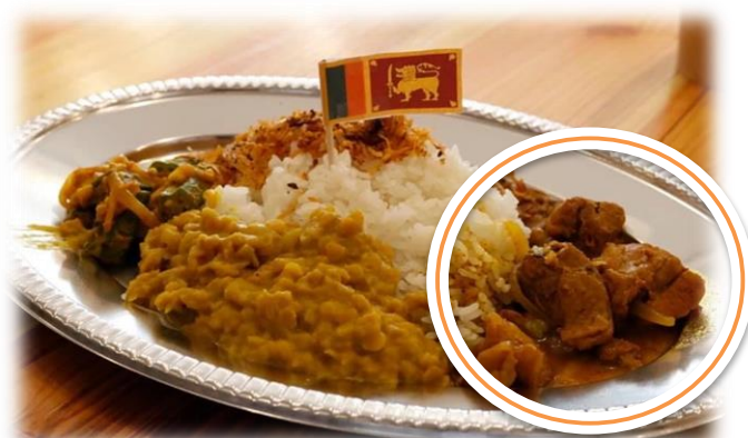
From the left, "Okra curry", "Lentil curry", "Chicken curry".

People in Sri Lanka eat curry every morning, day and night. It is a typical Sri Lankan style to eat curry by hand. The curry features a spicy taste with plenty of spices. We'll introduce how to make chicken curry in this article.