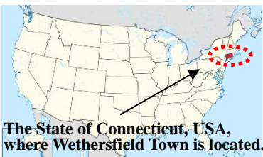
The State of Connecticut, USA, where Wethersfield Town is located.