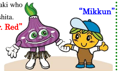
Mascot Characters from Wethersfield Town and Nagayo Town

Nagayo Town and Wethersfield Town, Connecticut, USA have similar geographic features, etc, so a sister town agreement was signed in 1997. Taking this as an opportunity, the Nagayo Town International Exchange Association was founded in 1998. The goal of our activities is to use exchange with people from all over the world to deepen mutual understanding, increase international awareness amongst local people, and to promote friendship and goodwill. Our core activities are language courses and international cooking classes, etc. There are weekly language courses for Chinese & Korean, as well as English, all year round.