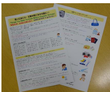
“Things to Know Before Disaster Strikes!!”